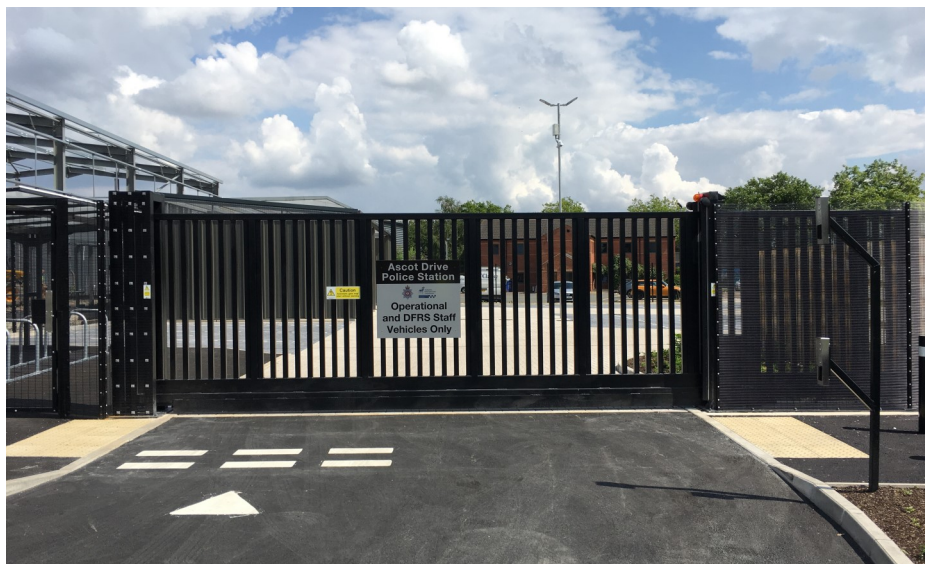
SSSRSG SALUS Sliding Gate

The SSSRSG SALUS LPS1175 Sliding Gate's versatility, paired with its ability to meet stringent security criteria, makes it the ideal choice for businesses and organisations looking to secure their premises. Whether protecting a commercial complex, industrial yard, or government building, this gate delivers superior performance and reliability, ensuring the safety and security of your assets.