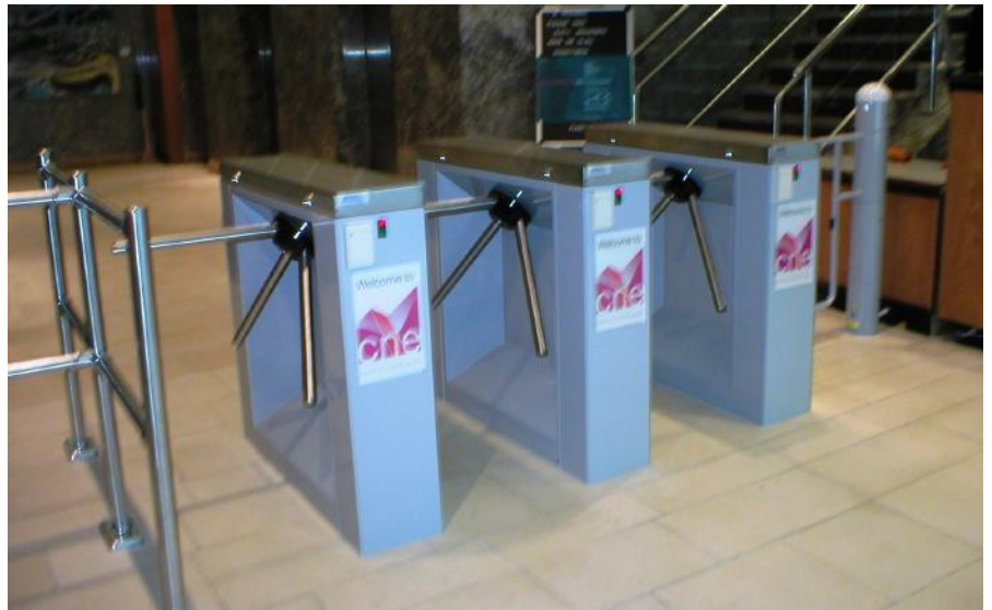
SSTS 1000 Indoor Turnstile

Security Solutions Phoenix House 7 Riverside Waters Meeting Road Bolton BL1 8TU