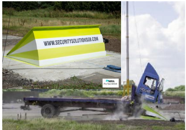
SSSB Bison Shallow Mount Road Blocker

Security Solutions, Phoenix House 7 Riverside, Waters Meeting Road, Bolton BL1 8TU