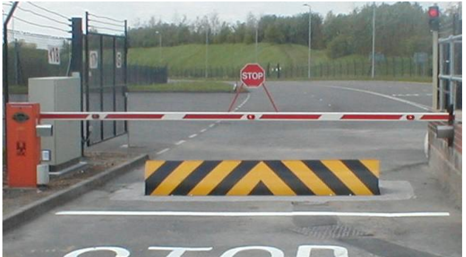
SSRB High Security Road Blocker

Security Solutions Phoenix House 7 Riverside Waters Meeting Road Bolton BL1 8TU