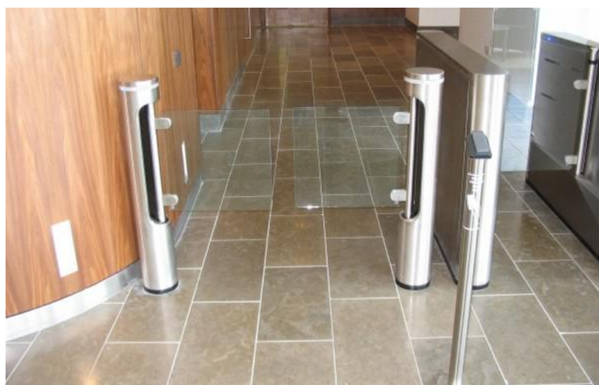
SSPG Pass Gate

Security Solutions Phoenix House 7 Riverside Waters Meeting Road Bolton BL1 8TU