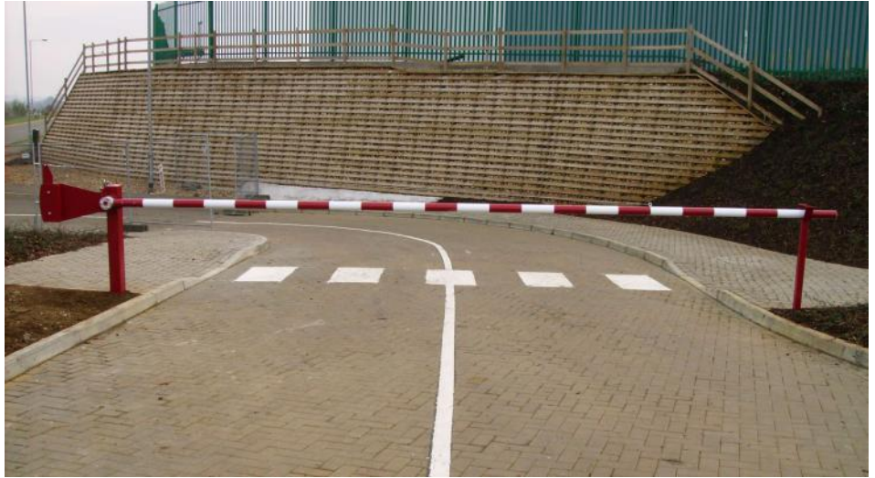
SSMB 9000 Manual Rising Arm Barrier

Security Solutions Phoenix House 7 Riverside Waters Meeting Road Bolton BL1 8TU