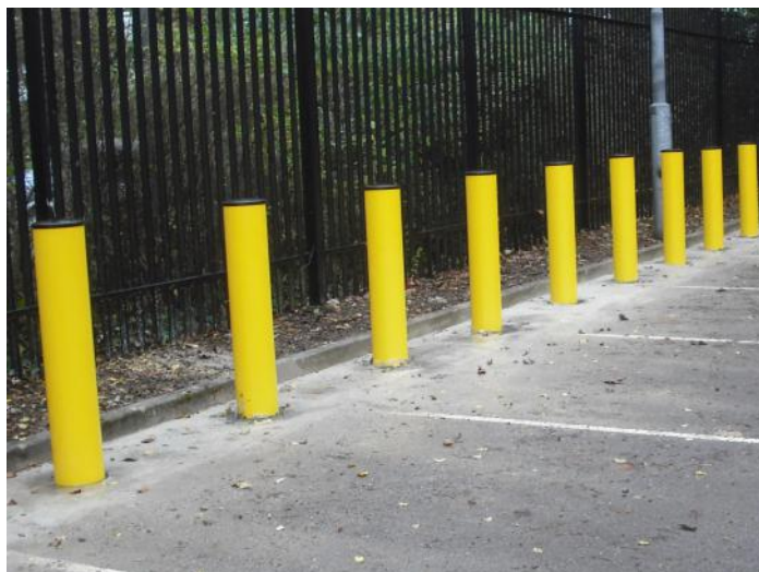
SSFB Cobra Crash Rated Fixed Bollards

Security Solutions, Phoenix House 7 Riverside, Waters Meeting Road, Bolton BL1 8TU