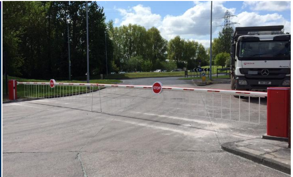
SSB 8000 ECO Automatic Rising Arm Barrier

Security Solutions offers a complete turnkey solution from design to handover along with a comprehensive after sales support to meet your immediate and long term needs.