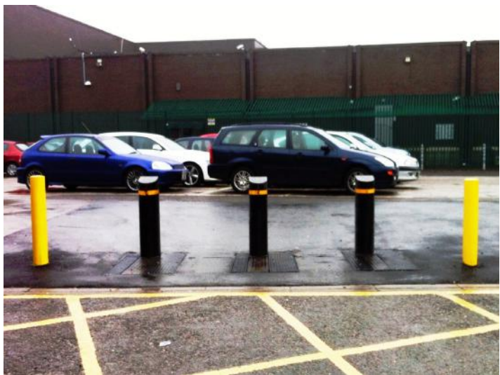
SSSB Cobra Shallow Mount Retractable Bollard

Security Solutions Phoenix House 7 Riverside, Waters Meeting Road Bolton BL1 8TU