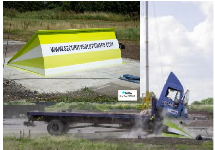
SSSB Bison Shallow Mount Road Blocker

Security Solutions, Phoenix House 7 Riverside, Waters Meeting Road, Bolton BL1 8TU