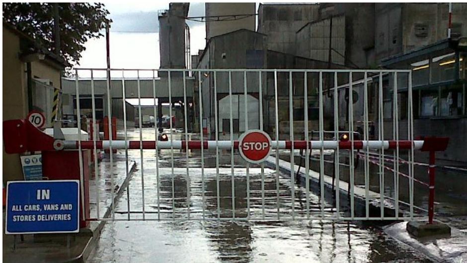
SSB 9000 Heavy Duty Automatic Rising Arm Barrier

Security Solutions Phoenix House 7 Riverside Waters Meeting Road Bolton BL1 8TU