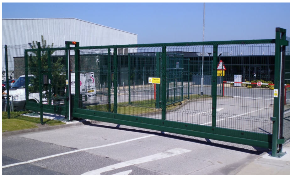
SSSG Steel Cantilever Sliding Gate

Security Solutions Phoenix House 7 Riverside Waters Meeting Road Bolton BL1 8TU