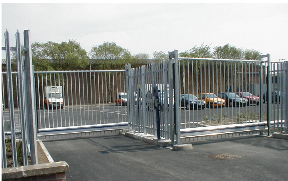
SSAG Aluminium Cantilever Sliding Gate

Security Solutions Phoenix House 7 Riverside Waters Meeting Road Bolton BL1 8TU